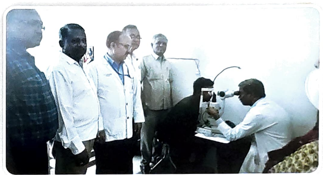
Free eye check-up camp conducted on the eve of Shri Shivandanda Math Jatra Mahotsava