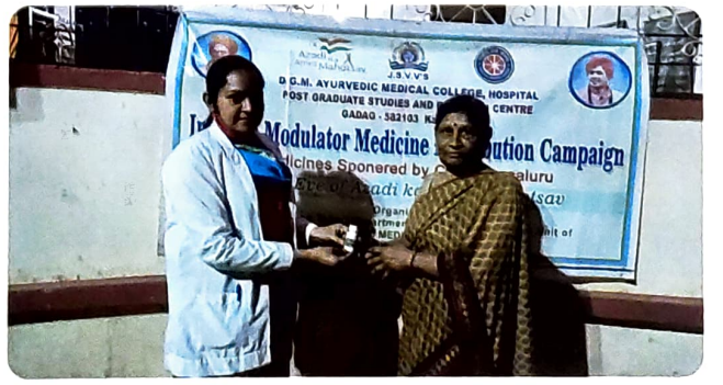
Immune modulator medicine Shamshamana vati distributed to more than 1000 peoples, it is sponsored CARL Bangalore