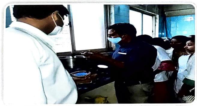
Works shop on Kshara preparation conducted on 16-3-2022 by dept of Shalya tantra