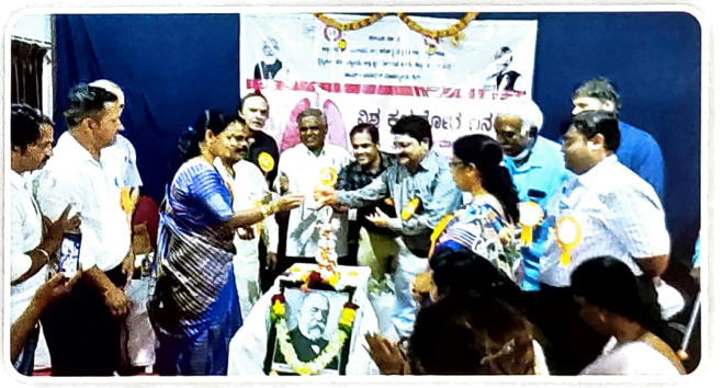
World tuberculosis day celebration made on 24-3-2022 in association with district health authority